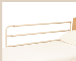
400HR Deluxe Rails