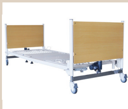
P5500 Standard Single 900mm Wide