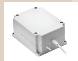
ABB Battery Backup