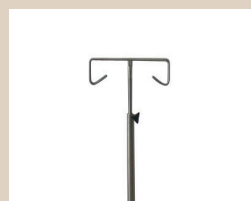
AIVP I.V. Pole