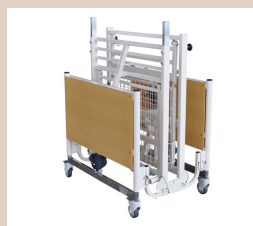
Transport Mode (Folded)