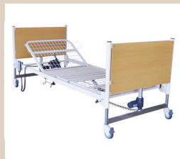
P5500W King Single 1070mm Wide