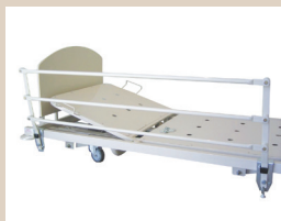
360HR Horizontal Side Rails