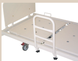
CLP400 Clamp On Support Rail 400mm