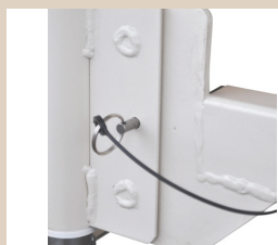
Pin Slot System