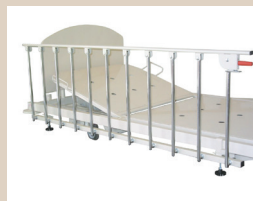
380VR Vertical Side Rails