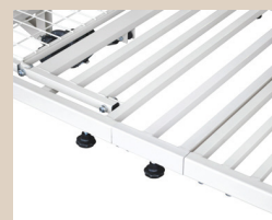
C.EXT5000 200mm Clip On Base Extension C.EXT5000W 200mm Clip On Base Extension