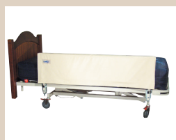
COT PRO Padded Side Rail Protectors