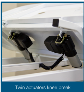
Twin actuators knee break