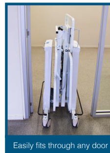
Easily fits through any door