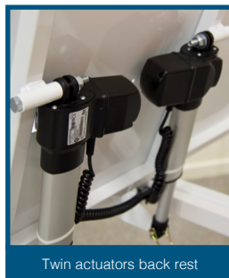
Twin actuators back rest